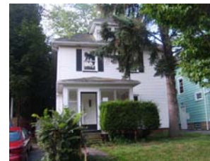
CHDO 147 Turpin St. Going Green

*As of 9/30/2008 City of Rochester RAP Funds have not been dissimilated.