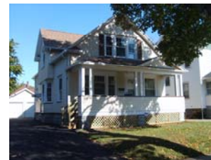
CHDO 114 Randolph St. Going Green